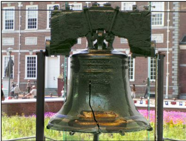
Independence Hall frames the Liberty Bell

Power of Education Research for Innovation in Policy and Practice Thursday, April 3 - Monday, April 7, 2014